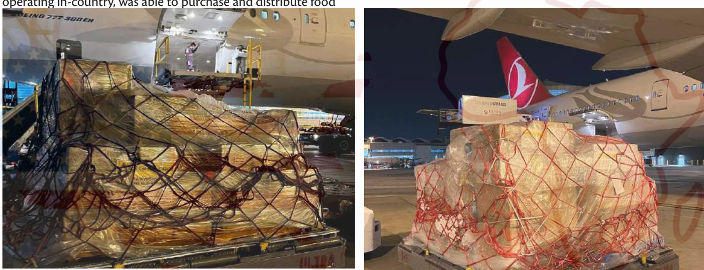
THANK YOU for being a partner in our efforts to connect resources and people from around the country to assist our brothers and sisters in need in the United States and Africa.

And from all of us at Christian Relief Services to our supporters who helped make it possible for us to help ease the burden for hundreds in the aftermath of the destruction and devastation, we say thank you for enabling us to continue being "A Gentle Voice for Good" across the country, and around the world.